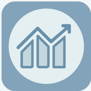
Step 1 MOMENTUM

The index has a 3-step rebalancing process built upon key financial concepts.