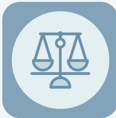
Step 2 RISK ADJUSTED WEIGHTS

Each day, a further mechanism is implemented: